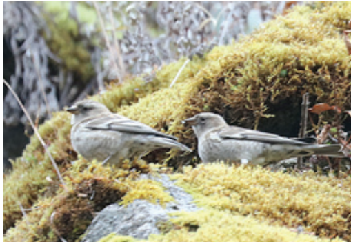
Plain Mountain Finch, Dulongjiang