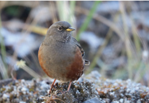
Alpine Accentor, Dulongjiang