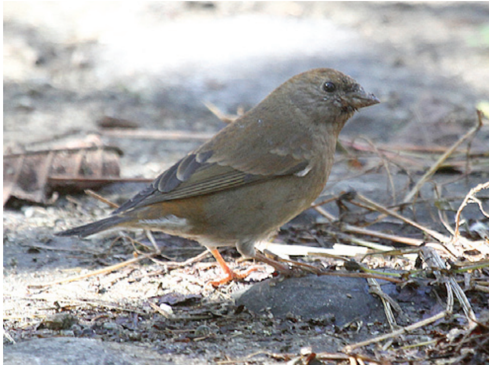
Blanford's Rosefinch, Dulongjiang 19th nov 2015