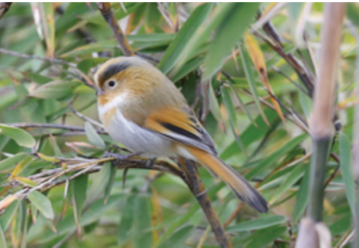
Fulvous Parrotbill, Dulongjiang