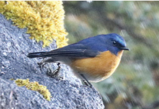
Rufous-breasted Bush-robin, Dulongjiang