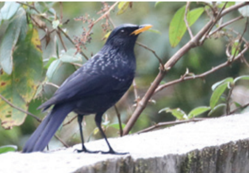
Blue Whistling Thrush ssp temminckii , Dulongjiang